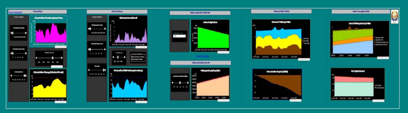
Figure 1. Sets the system with a Base Case. The scenario assumes that the watershed historical record from 1970 will repeat itself in 2006.