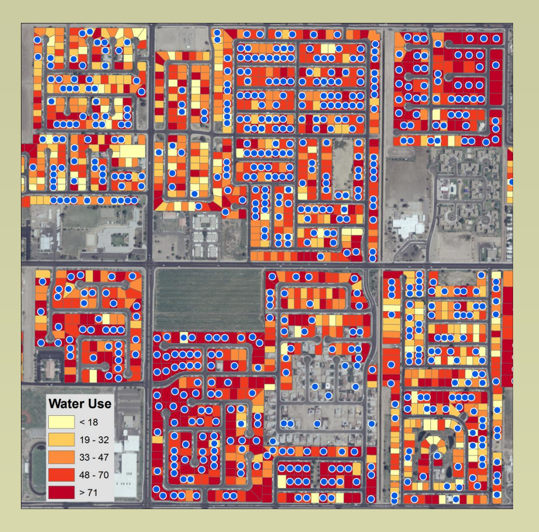
Map 3. The blue points represent pools. This is an example from August of 2009 displaying the clustering of pools in high water usage areas.