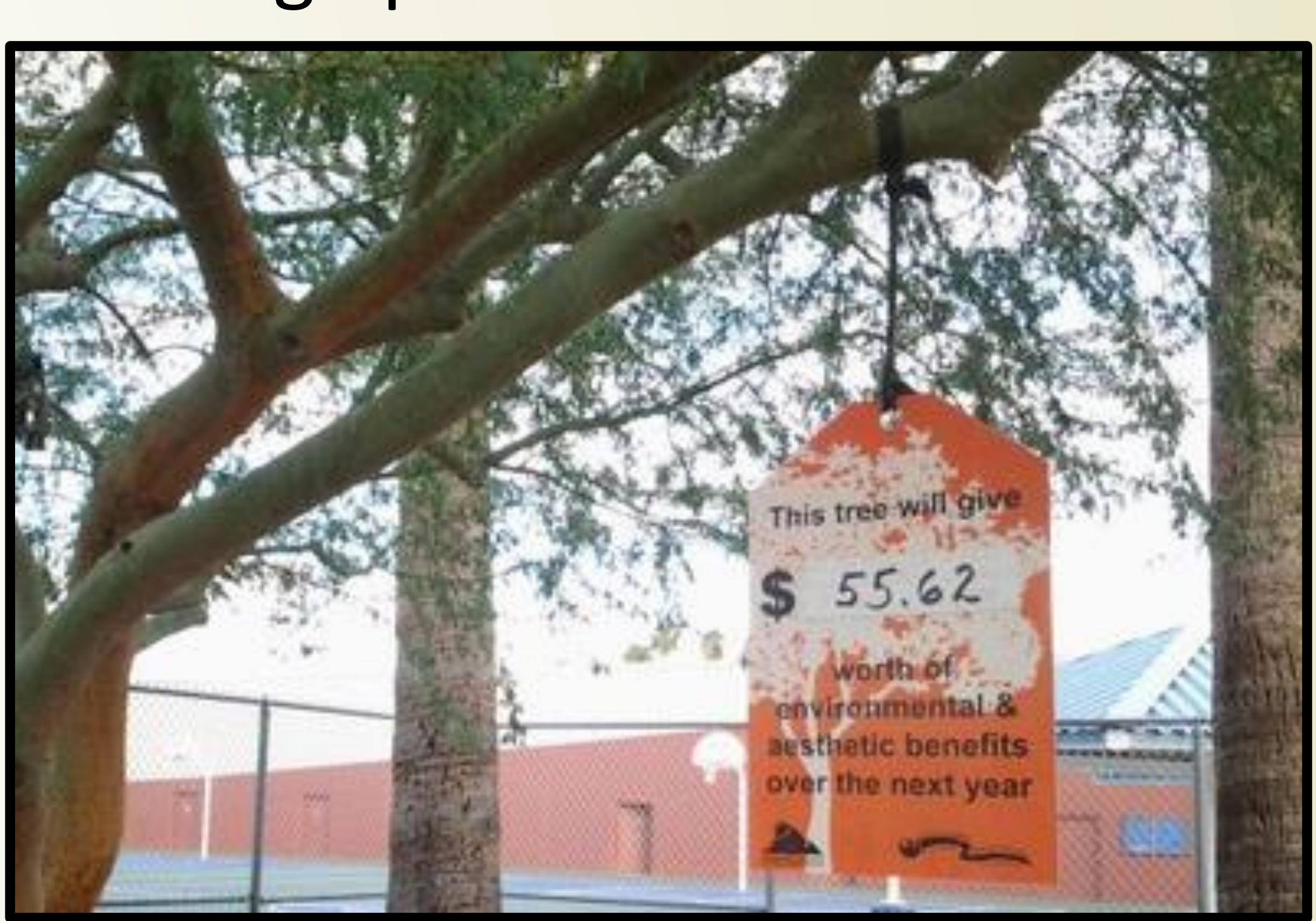
City of Phoenix tree "price tag" demonstrates the economic value of trees to local residents

Arizona sycamores, acacias, and cascalotes are ideal trees to add to this percentage because of their low water use and large shade areas, providing optimal benefit at low cost.