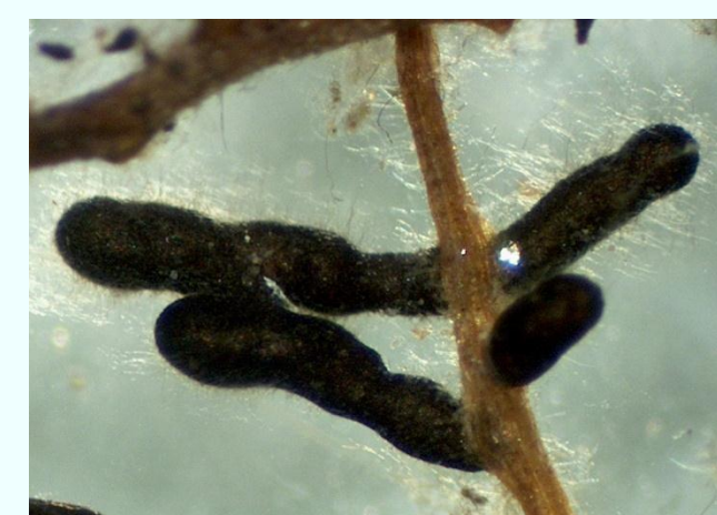
Figure 2. Ectomycorrhizae colonize plant roots externally, forming a dense fungal sheath or mantle that covers the outside of the root tips. A Hartig net of hyphae also grows within the root cortex.