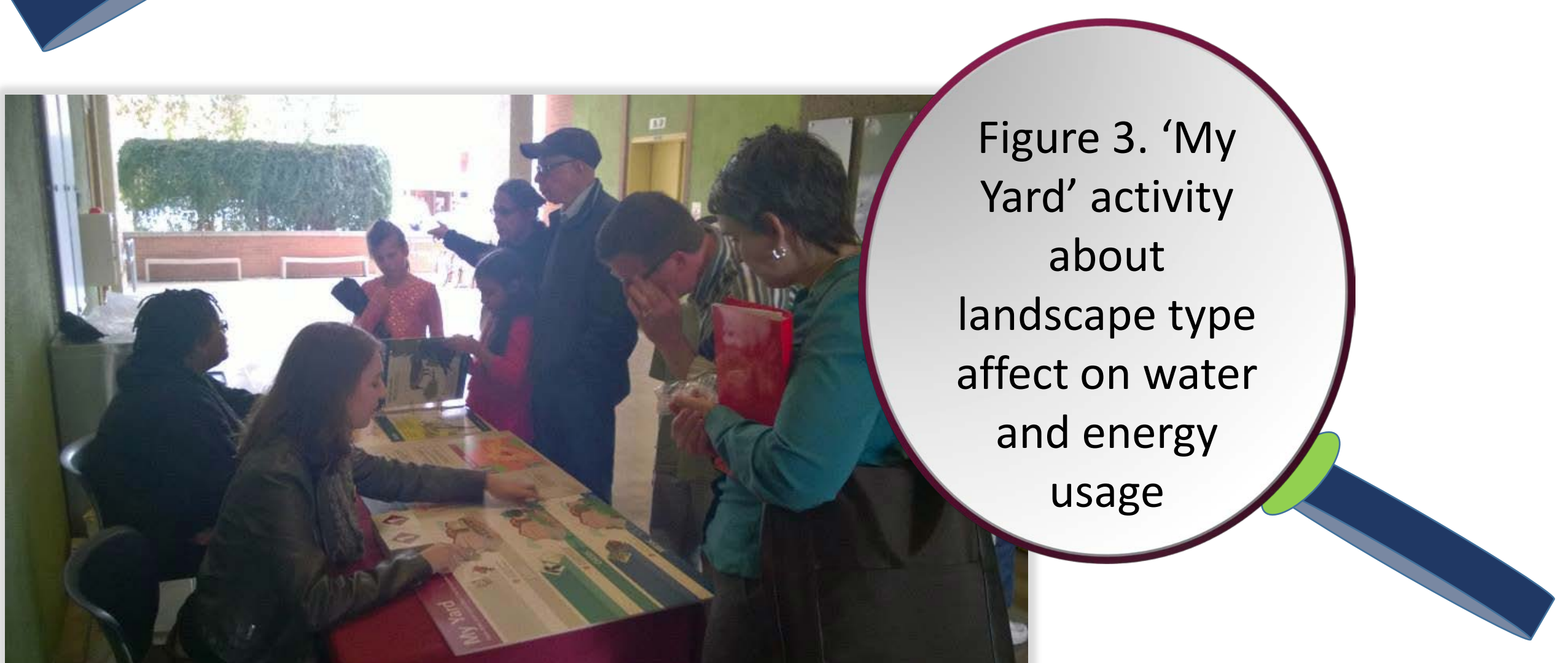
Figure 3. 'My Yard' activity about landscape type affect on water and energy usage