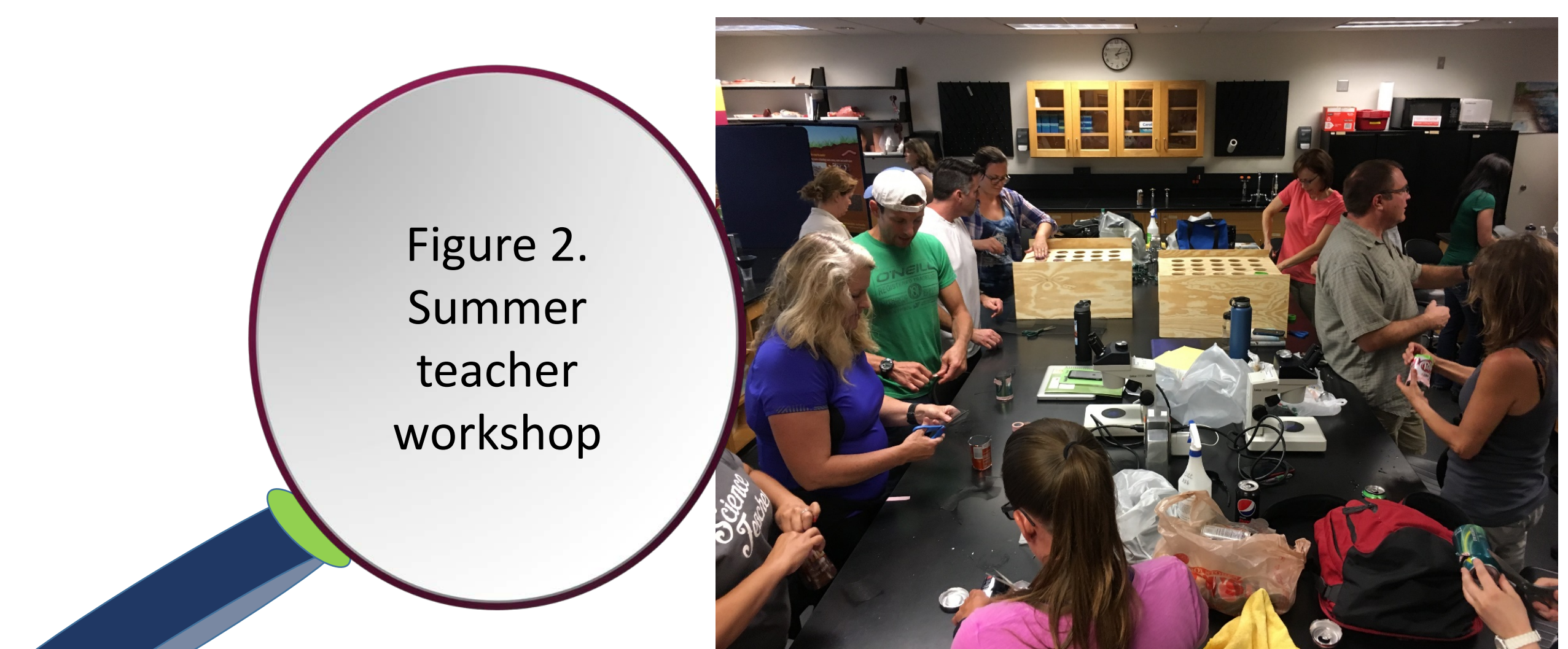
Figure 2. Summer teacher workshop