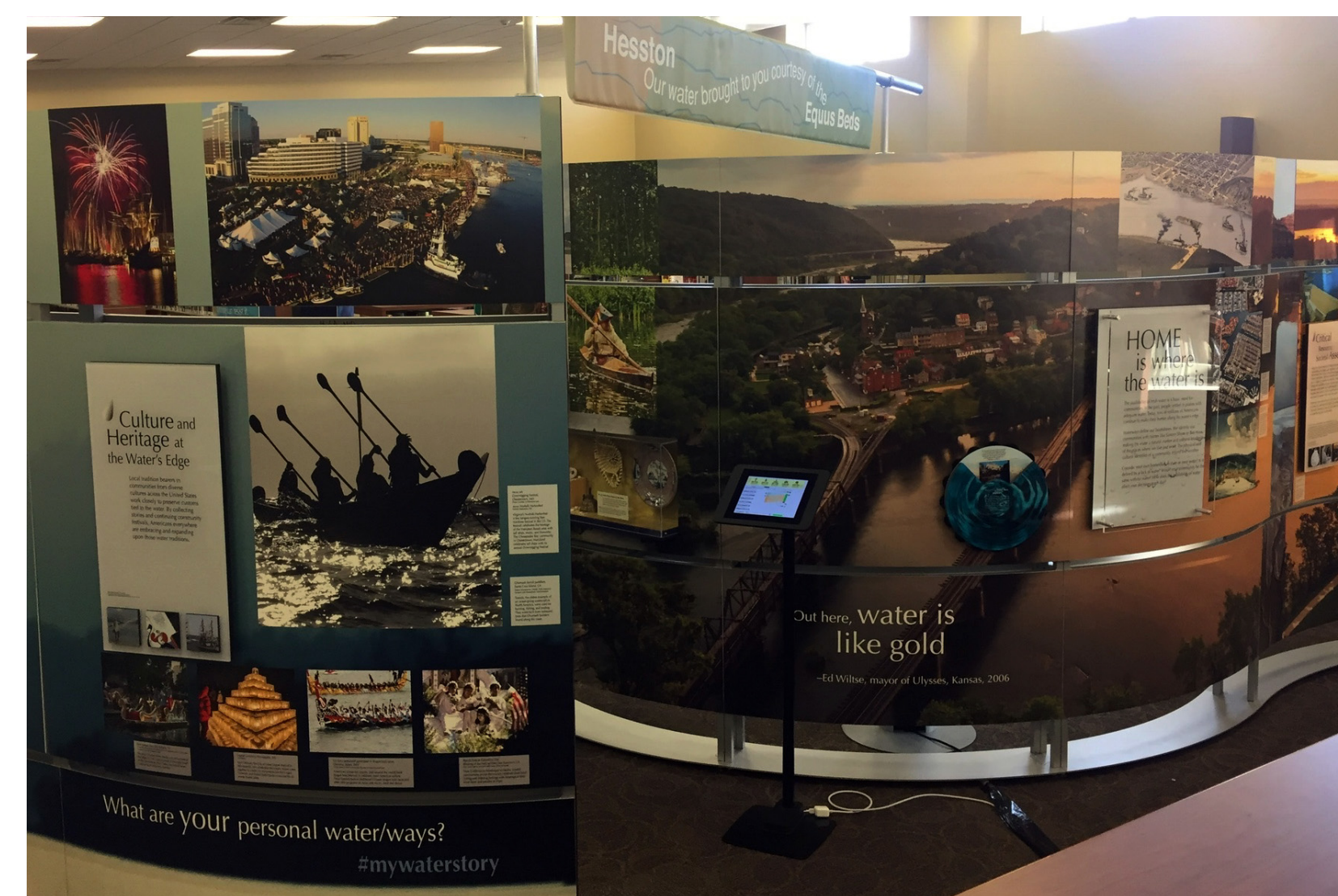
Water/Ways exhibition at Hesston Public Library in Hesston, Kansas

DCDC first created the WaterSim Phoenix model to estimate water supply and demand for the Phoenix Metropolitan area. Users can explore how water sustainability is influenced by various scenarios of regional growth, drought, climate change impacts and water management policies. WaterSim America is a new tool that expands on the modeling effort of WaterSim Phoenix to a state level.