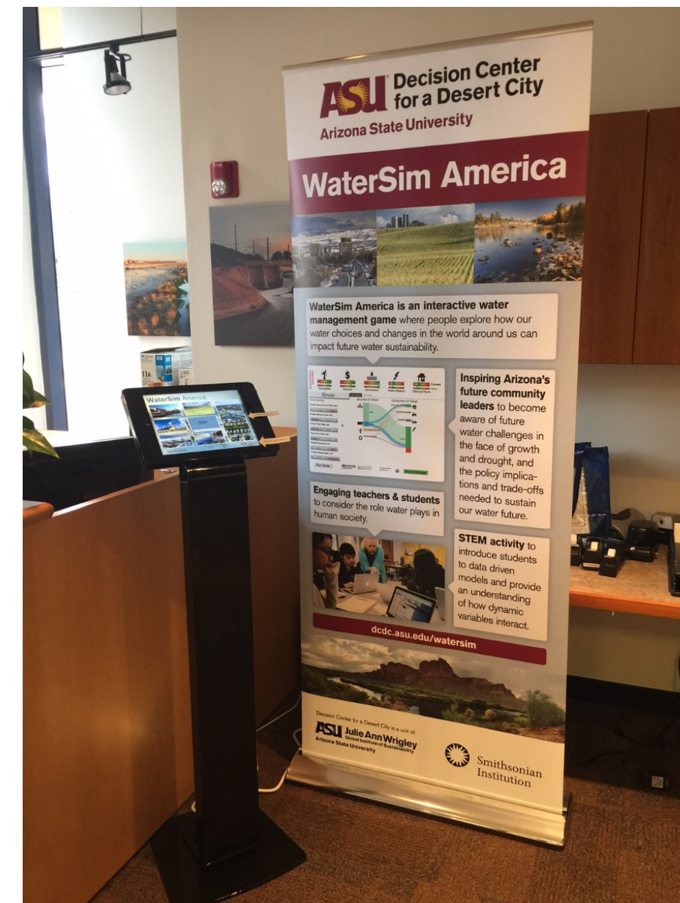
WaterSim America Kiosk

Decision for a Desert City (DCDC) is a water, climate, and decision research center within the Julie Ann Wrigley Global Institute of Sustainability at Arizona State University. DCDC was established in 2004 with an investment from the National Science Foundation (NSF) through the Decision Making Under Uncertainty (DMUU) program. Our mission is to advance knowledge about decision making under uncertainty in the context of water sustainability and urban climate-change adaptation.