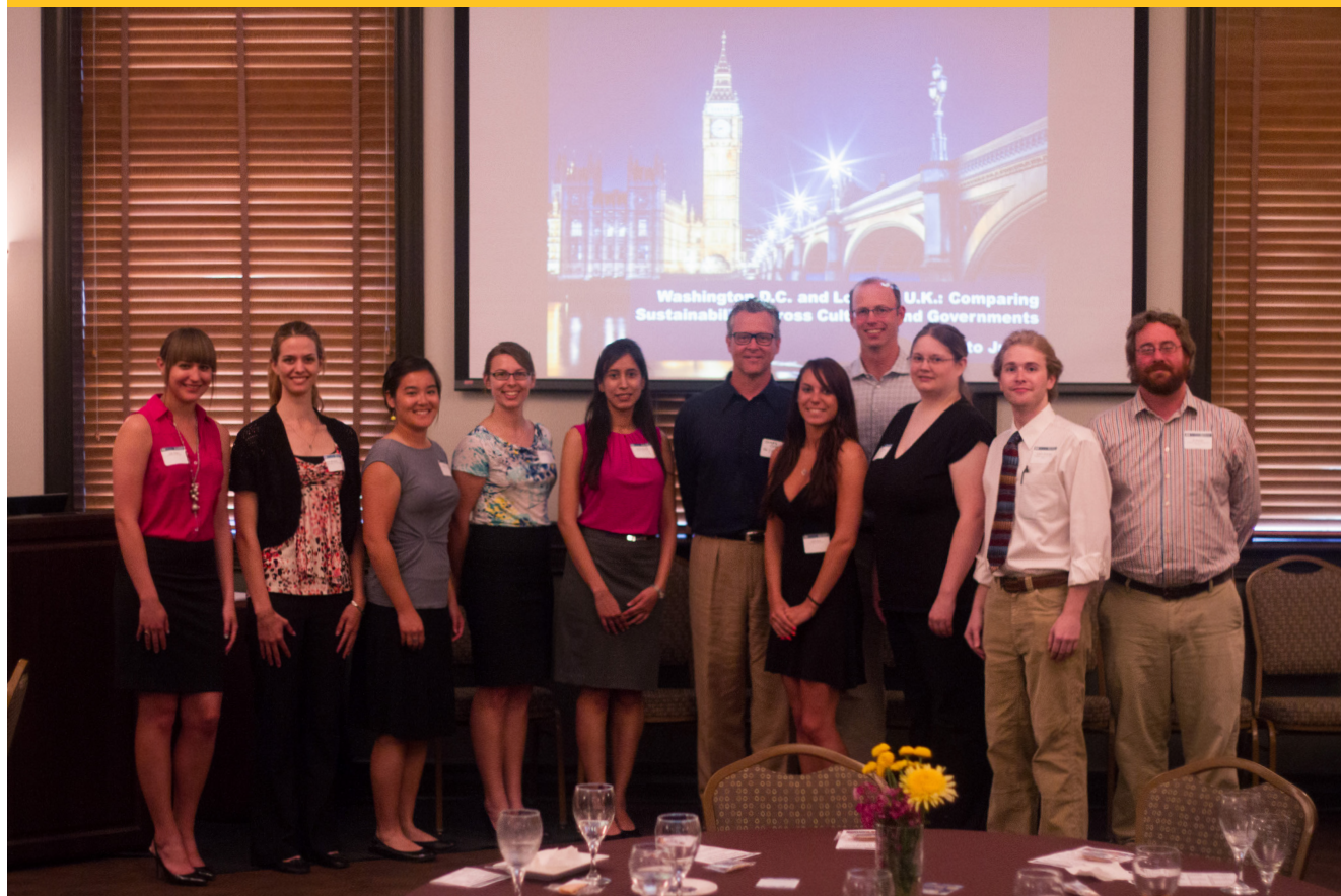
Students and Faculty of the Comparing Sustainability across Cultures and Governments program