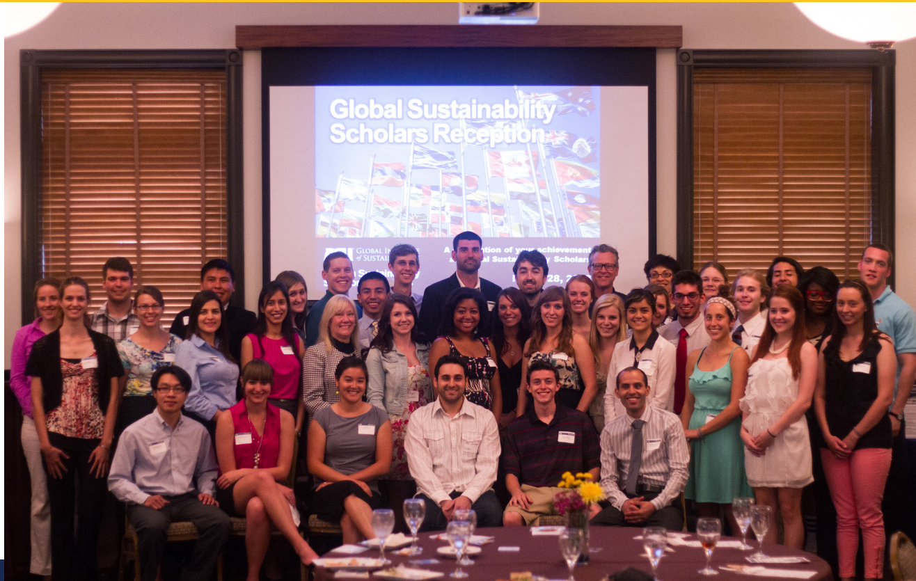
Global Sustainability Scholars Class of 2013