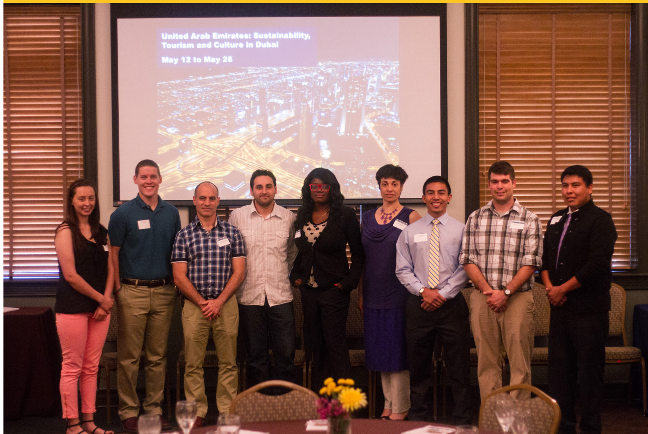
Students and Faculty of the Sustainability, Tourism, and Culture in Dubai program