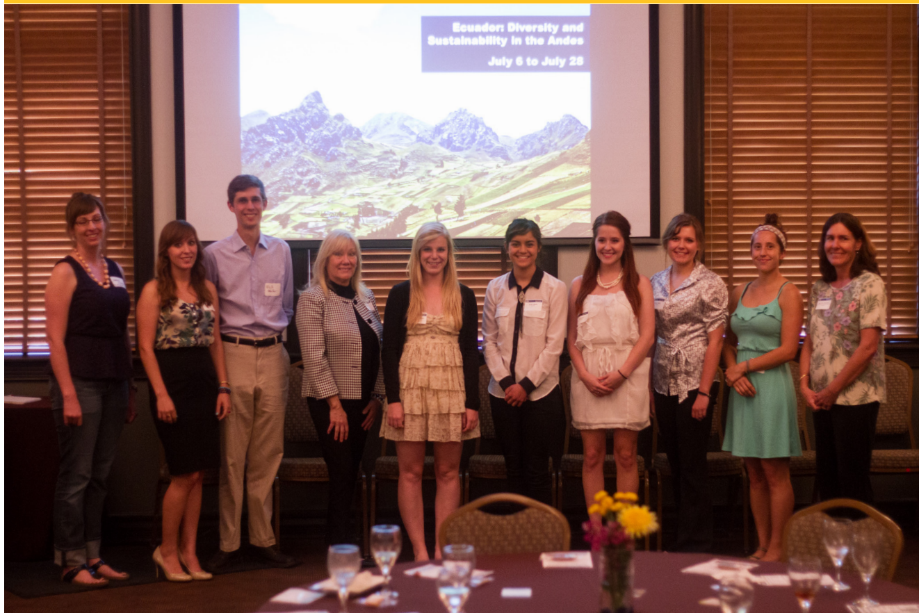
Students and Faculty of the Diversity and Sustainability in the Andes program