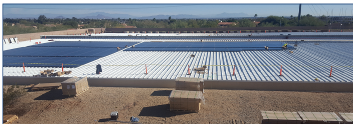
Tempe's South Water Treatment Plant (50MGD) solar sized at 924 kW became operational in March 2014 and the Johnny G Martinez

The Phoenix Lake Pleasant Water Treatment Plant (LPWTP) at 7.5 MW- DC is by far the largest on-site solar generation facility of Arizona water plants surveyed. The LPWTP photovoltaic complex began operation in January 2013 and produces about 15.2 million kWh per year. Surplus power generated is pushed back into the APS system. APS provides credits for the surplus energy, which can then be used at night, or on cloudy days. The solar was designed to meet 70% of LPWTP's energy needs at a water production rate of 50 MGD; but LPWTP is currently producing only about 27 MGD. Thus a surplus of solar credits is accumulated over the year. At the end of the year, APS pays Phoenix the prevailing wholesale rate (about $0.03 per kWh) for the accumulated credits. The LPWTP solar provider charges about $0.07 per kWh, so this arrangement results in a $0.04 per kWh for the accumulated credits. Though the LPWTP solar facility will likely be financially beneficial for Phoenix in the long run, Andy Terrey, Project Coordinator for the Water Services Department, stresses "Water utilities need to thoroughly understand how solar impacts the cost of power delivered from the grid, and how that impacts their bottom-line energy costs."