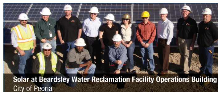
Solar at Beardsley Water Reclamation Facility Operations Building City of Peoria

Six Arizona communities purchased solar systems. A key factor in decisions to own their solar were low interest loans from the Water Infrastructure Finance Authority (WIFA). WIFA offers a “green project” program using EPA grant monies for sustainable construction like water and energy efficiency, green storm water and other environmentally innovative projects. An attractive financial incentive for green projects can involve debt forgiveness – sometimes over 50% for economically disadvantaged communities. The following communities secured WIFA loans for their solar construction: