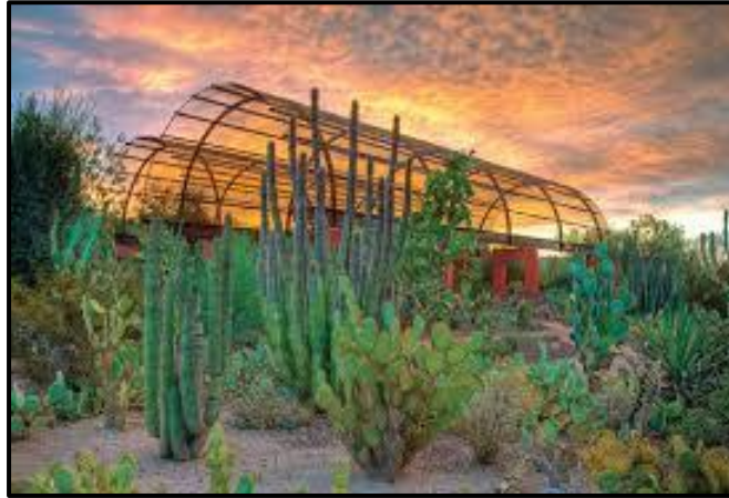
Desert Botanical Garden