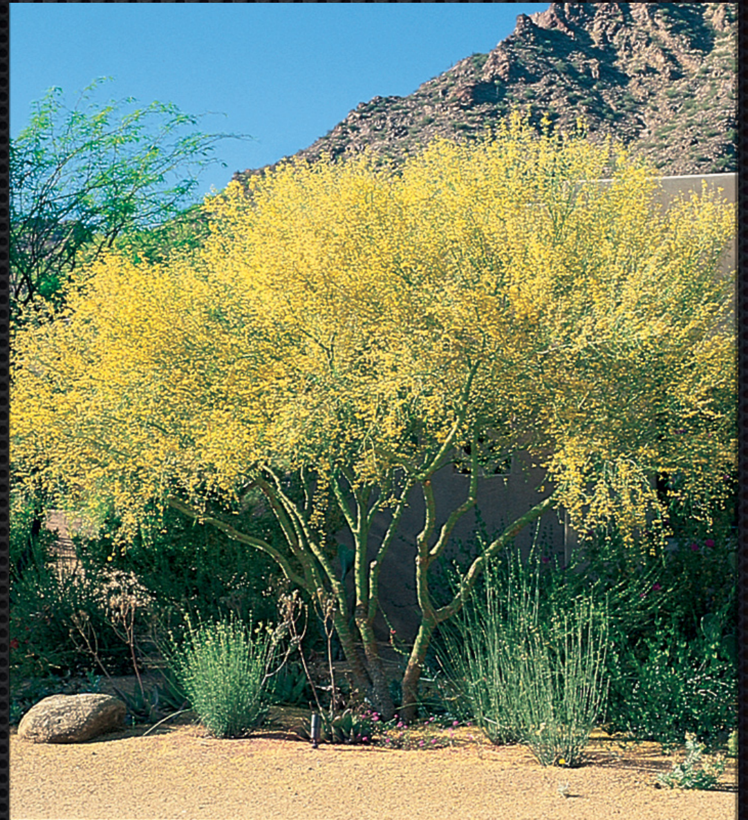
Foothills Palo Verde

Water saved can be relocated to the tree project and still have a lower net water use through smart tree management