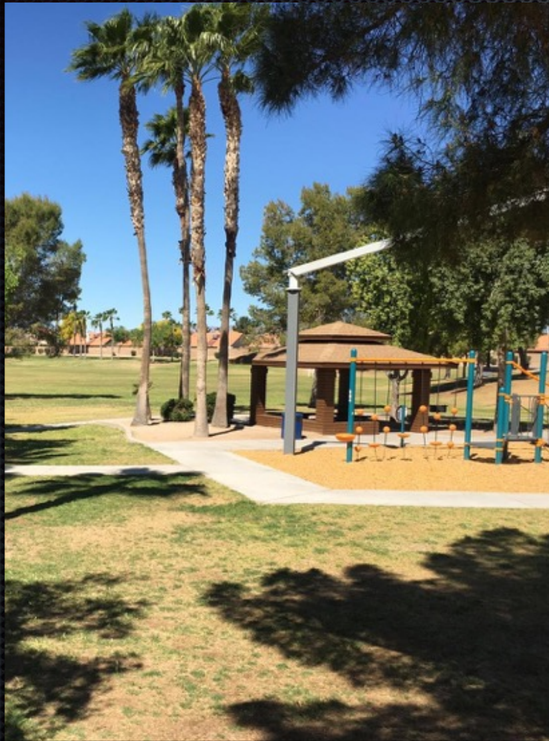
Actual park in Goodyear