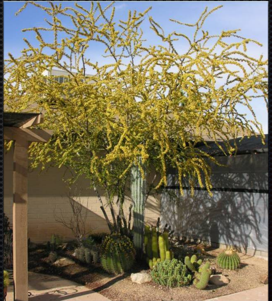
Black Brush Acacia