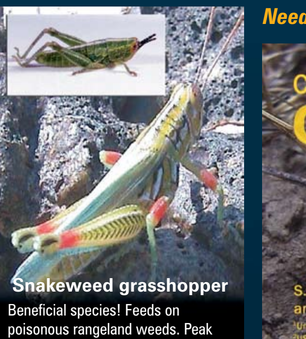
hatch range: May 15 – June 15. Female body length: