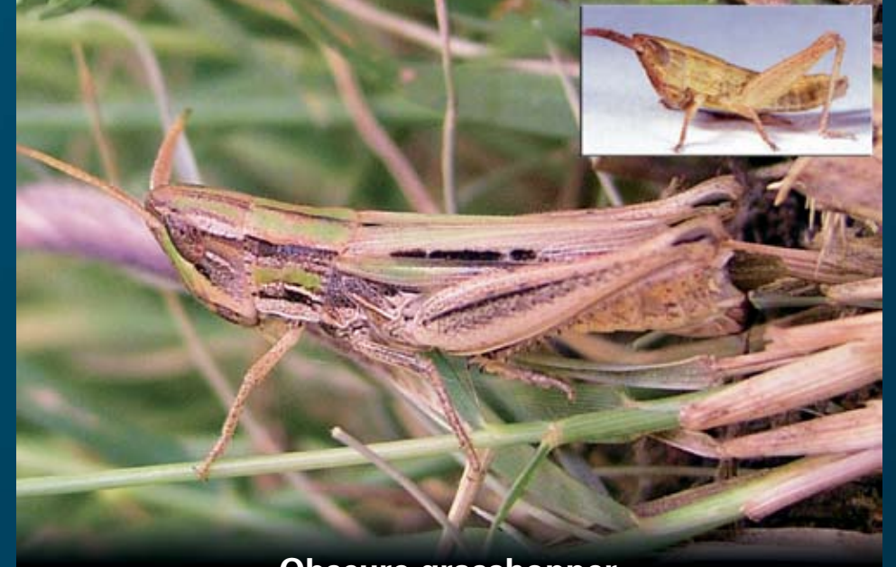
Obscure grasshopper Takes bran bait well. Pest of range grasses. Peak hatch range: June 21 – July 1. Female body length: