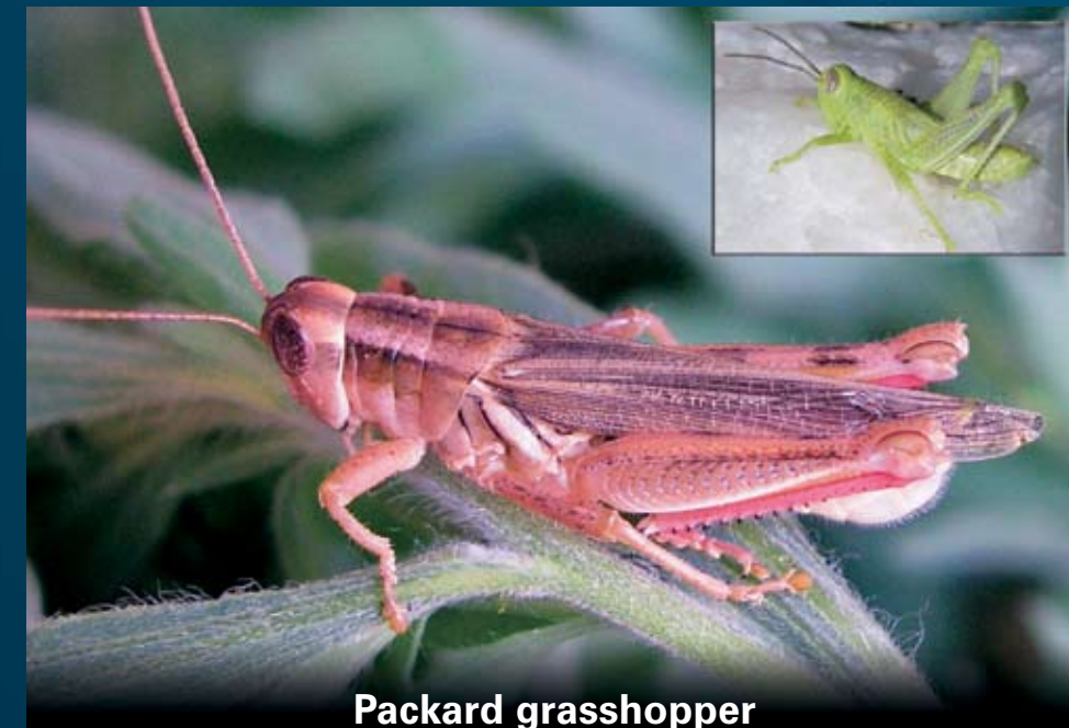
Takes bran bait well. Pest of crops and forage. Peak hatch range: May 1-30. Female body length: