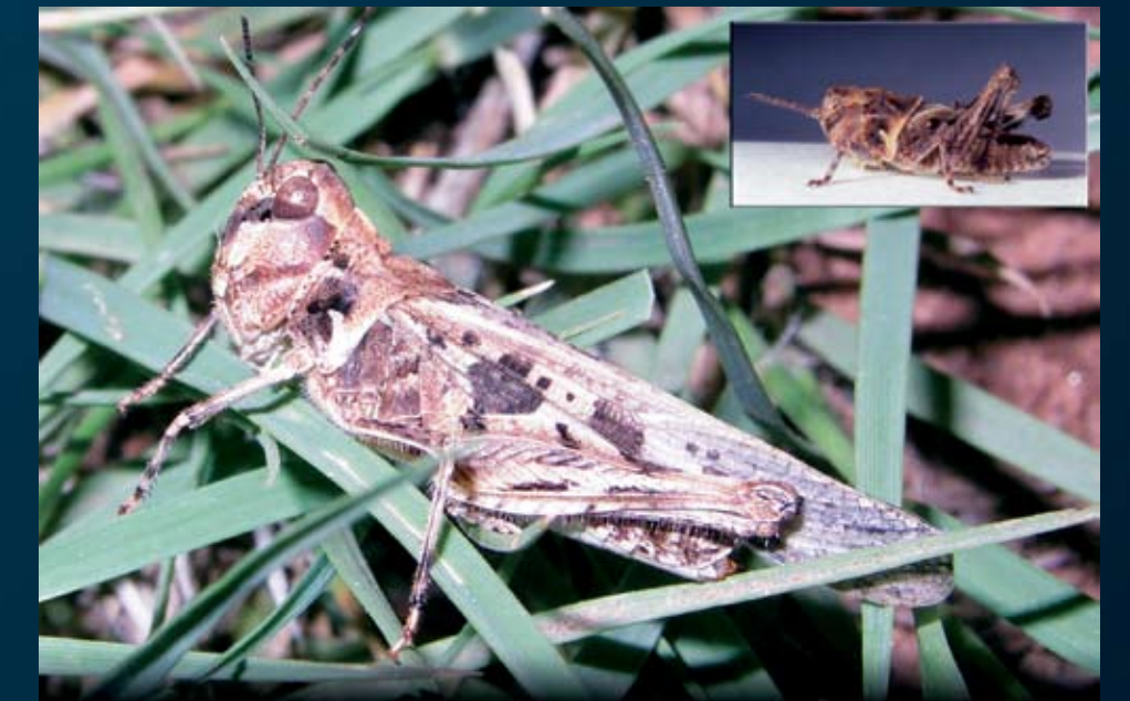
Kiowa grasshopper Does not take bran bait. Pest of range grasses. Peak hatch range: June 7- 21. Female body length: