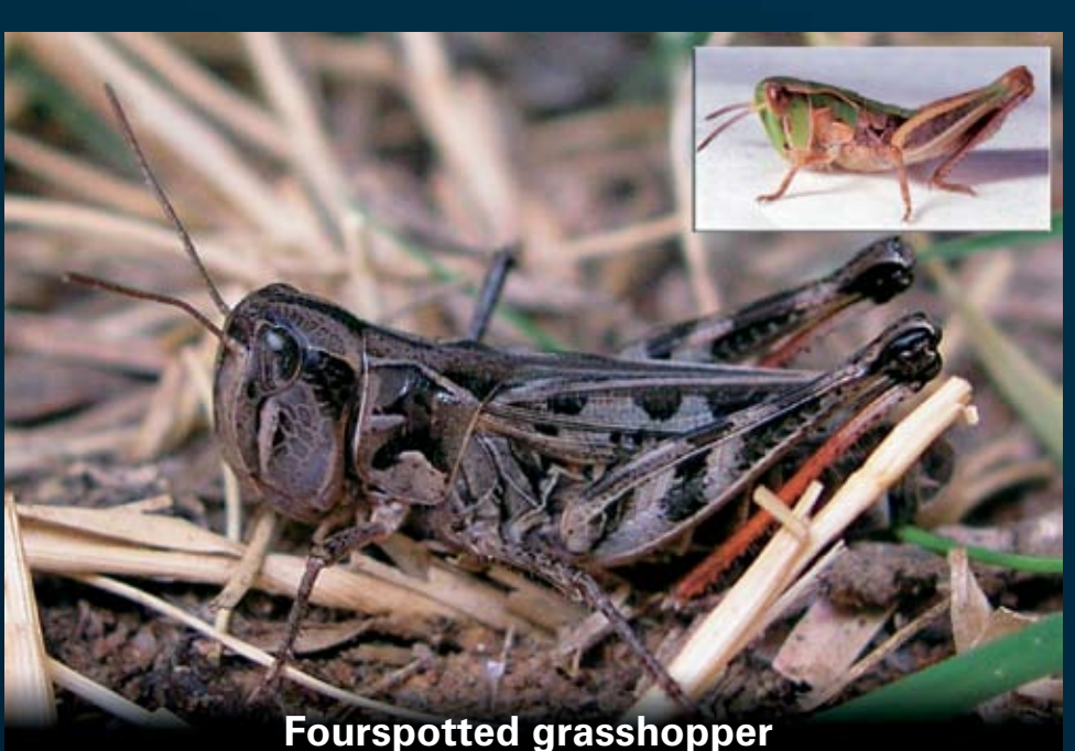
Does not take bran bait. Pest of range grasses. Peak hatch range: June 21 – July 1. Female body length: