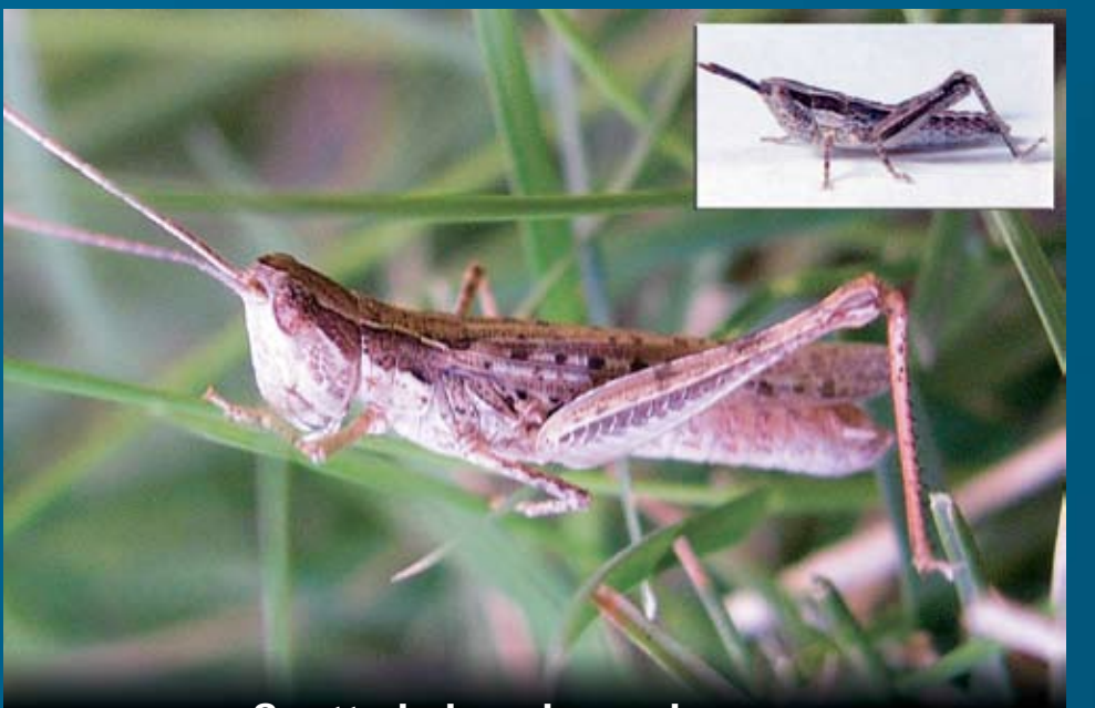
Spottedwinged grasshopper Does not take bran bait. Pest of range grasses. Peak hatch range: May 15 – June 15. Female body length: