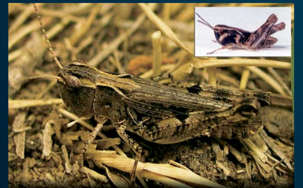
Whitewhiskered grasshopper Takes bran bait well. Pest of range grasses and sedges. Peak hatch range: May 15–June 15. Female body length:

Flabellate grasshopper Takes bran bait well. Pest of range forage, likes forbs. Peak hatch range: May 15 - June 15. Female body length: Note -- This species may be beneficial at low densities in that it consumes the reproductive parts of cactus flowers.