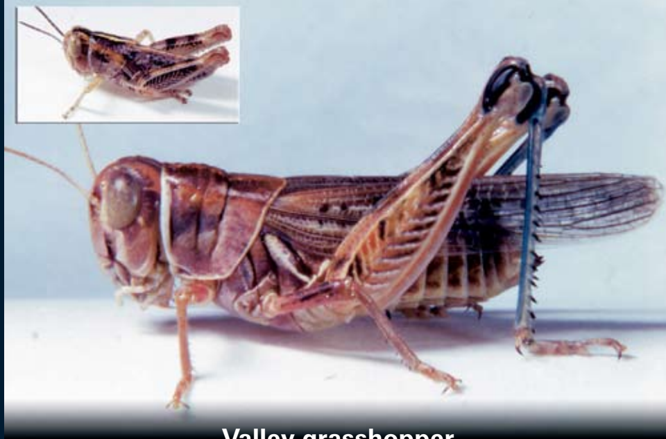
Valley grasshopper Takes bran bait well. Pest of forage and crops. Peak hatch range: April 7 – May 15. Female body length: